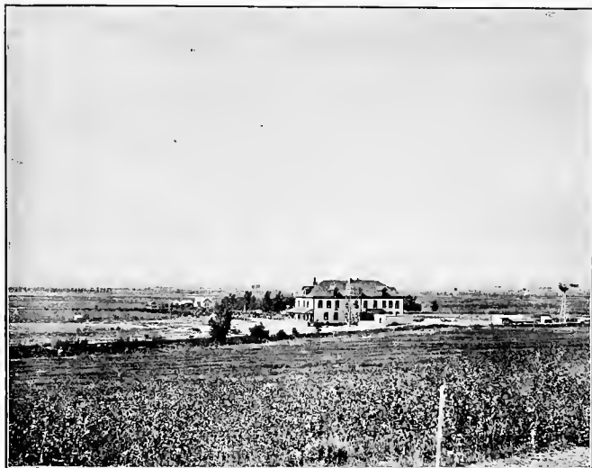
THE SANATORIUM, FORT AMITY.